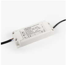
IP20 Driver included