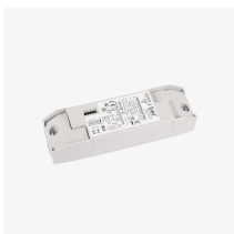
Driver DALI & PUSH 150-700mA 8-26W 220-240V Ref. 4.1069.6101