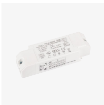
Driver ON-OFF 150-500mA 6,3-21W 240V Ref. 4.1069.1101