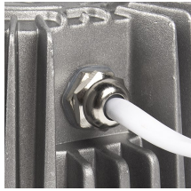
IP65 cable gland