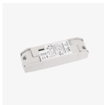
Driver DALI & PUSH EU 300-1050mA 3-38W 220-240V Ref. 4.3069.6101