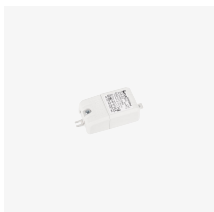
Driver ON-OFF EU 500mA 2,5-22W 200-240V Ref. 4.3062.1101